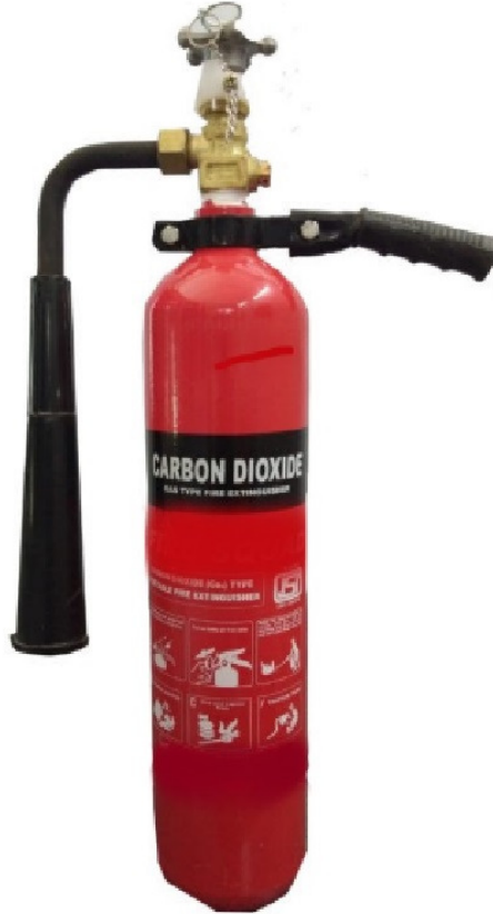
Co2 type Fire Extinguisher 4.50kg

Item No.47 Providing & Fixing 6.00 Kg ABC type Fire Extinguisher with all required equipment & Labour comp.