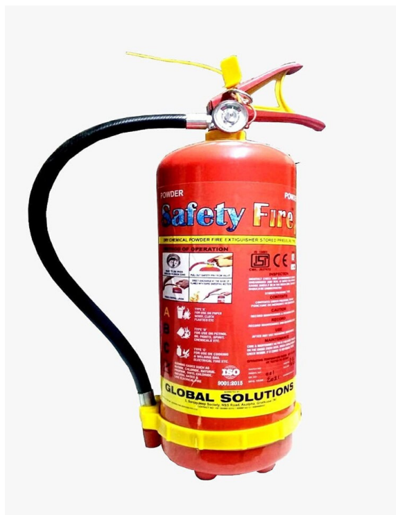
ABC type powder Fire Extinguisher 6kg